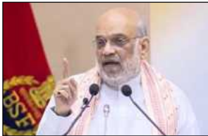
India has decided that not only will we stop infiltration but we will find each and every infiltrator and send them out of the country," Shah said. He added his government will not allow "artificial change in our demography being attempted from the other side." "I want to assure BSF troops that we will launch the smart border project within the 60th year of its raising and we will make the Bangladesh and Pakistan borders impenetrable through major technical assistance," Shah said. The "smart border"

NEW DELHI, MAY 22: Union Home Minister Amit Shah on Friday said the government will launch a tech-enabled "smart border" project by the next year to make the 6,000-km fronts with Pakistan and Bangladesh impenetrable and ensure that the "conspiracy" to change the demography of the country is defeated. Delivering the annual Rustamji Memorial lecture hosted by the Border Security Force (BSF) here, the minister also reiterated that the government will find each and every infiltrator and send them out of India. K F Rustamji was the founding father and the first director general of the BSF, the world's largest border guarding force with about 2.70 lakh personnel tasked to guard Indian borders with Pakistan on the west and Bangladesh on the east. It was raised in 1965. "The government of