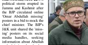
SRINAGAR, MAY 22: A political storm erupted in Jammu and Kashmir after the BJP circulated online 'Omar Abdullah missing' posters in a bid to mock the chief minister. The BJP's J&K unit shared the 'missing' posters on its social media handles, seeking information about Abdullah and claiming that he has been "missing for the last ten days". The saffron party's criticism comes amid reports that the chief minister is outside Jammu and Kashmir on a personal visit. Reacting to the posters, National Conference president

Farooq Abdullah hit back at the BJP, saying that the saffron party has "nothing better" to do. "They have their own campaigns, they know what they are doing. We don't have to answer them," the senior Abdullah told reporters after offering the congregational prayers at the Hazratbal shrine here. Farooq also brushed aside rumours of a split in alliance with the Congress in Jammu and Kashmir. "I think it is our enemies who are saying all this. The alliance is there, nothing will happen," he said.