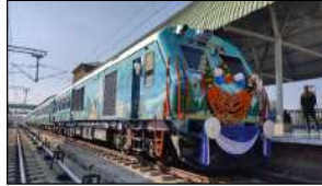
NIN NEWS SERVICE JAMMU, MAY 22