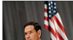
Tuesday. Besides his engagements in New Delhi, Rubio is also scheduled to visit Kolkata, Agra and Jaipur, people familiar with the matter said. There is a possibility of the US Secretary of State calling on Prime Minister Narendra Modi as well, it is learnt. "There's a lot to work on with India, they're a great ally and partner. We do a lot of good work with them so this is an important trip," Rubio said on Friday about his trip to