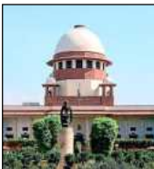
ernment employees, from reservation. "If both parents are IAS officers, why should they have