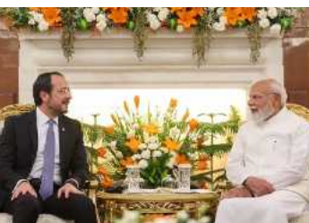
cial capital and open new avenues for Indian companies in Cyprus's infrastructure, energy, and agriculture sectors, while simultaneously boosting investment in India's booming shipping and maritime industries. "The relationship between India and Cyprus has stood the test of a time and again, with today's decision to upgrade the ties to strategic partnership, we are

NEW DELHI, MAY 22: India and Cyprus on Friday elevated their ties to a strategic partnership and unveiled a five-year roadmap for defence cooperation as Prime Minister Narendra Modi held wide-ranging talks with Cyprus President Nikos Christodoulides. The two sides signed six agreements to provide for deeper cooperation in areas of innovation, technology, education and culture besides agreeing to soon conclude a comprehensive partnership on migration and mobility. The pact, termed up included one on establishing a joint working group on counter-terrorism. The talks between the two leaders primarily focused on boosting ties in trade and investment, critical technologies, education, and implementation of the ambitious India-Middle East-Europe Economic Corridor. In his media statement, Modi highlighted that the strategic partnership will unlock commer-