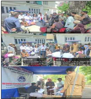
treatment, completion of the full course of medication, and community awareness in controlling the spread of TB. They also highlighted the need to