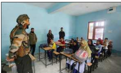
NIN NEWS SERVICE JAMMU, MAY 22

As part of its continued efforts towards youth awareness and the vision of Nasha Mukti Bharat, the Indian Army organised anti-drug awareness activities at Lower Dogriyan in District Poonch and Mardiyala Mohalla, Kalsa, in District Rajouri. At Government Middle School,