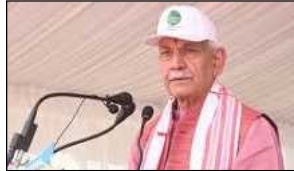
JAMMU, MAY 22: Lieutenant Governor Manoj Sinha on Thursday said that drugs and terrorism are "two sides of the same coin" in Jammu and Kashmir, asserting that investigations have revealed direct links between narcotics smuggling networks and terror organisations operating in the region. Addressing a programme on the drug-free Jammu and Kashmir campaign, the LG said evidence gathered during various investigations has shown the involvement of the neighbouring country

in promoting drug smuggling to finance terrorism and radicalisation activities. He said that while some smugglers may have amassed wealth and constructed houses through illegal trade, the larger share of the money ultimately reaches organisations involved in radicalising youth, purchasing weapons and spreading terrorism in Jammu and Kashmir and other parts of the country. Manoj Sinha said the primary objective of the administration is to safeguard the younger generation from the menace of drugs, adding that a